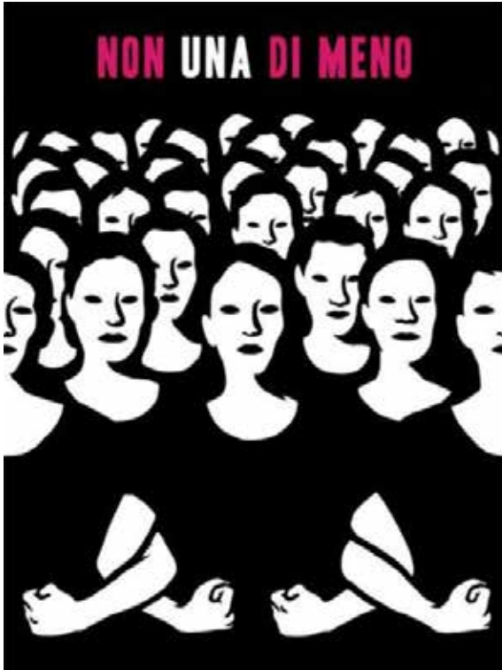
Non Una Di Meno 2017