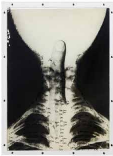
Ketty La Rocca, Craniologia 5, 1973, 2 parts, overlapped, x-ray and handwriting on plexiglass, 70 x 50 cm.

Ketty La Rocca (La Spezia, 1938 - Firenze, 1976): Contemporary avant-garde artist, Ketty La Rocca tried to respond to the information bombardment typical of the language of the new mass society with the same "weapons": slogans, billboards, stereotypical images, subversive visual-verbal collages created by cutting and pasting images from advertisings, road signs. Furthermore, in the famous series "Craniologia" La Rocca has superimposed her finger s over the ray-x image of her cranium. For example, in Craniologia 5 (1973), the position of the finger looks as if it is poised to shut up the woman.