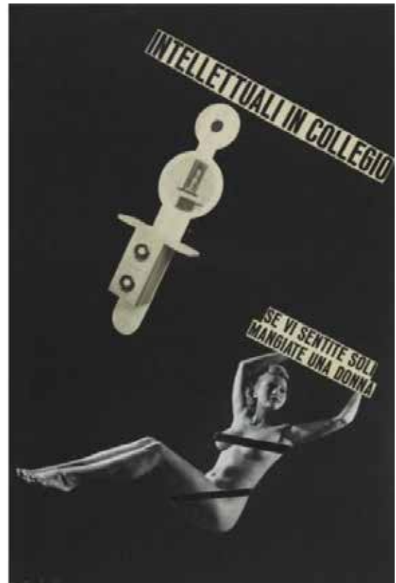
Ketty La Rocca, Documentazione fotografica dell'azione Approdo, 1967.