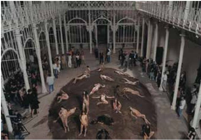
Performance VB53 Tepidarium del Giardino dell'Orticultura, 2005

Ketty La Rocca (La Spezia, 1938 - Firenze, 1976): Contemporary avant-garde artist, Ketty La Rocca tried to respond to the information bombardment typical of the language of the new mass society with the same "weapons": slogans, billboards, stereotypical images, subversive visual-verbal collages created by cutting and pasting images from advertisings, road signs. Furthermore, in the famous series "Craniologia" La Rocca has superimposed her finger s over the ray-x image of her cranium. For example, in Craniologia 5 (1973), the position of the finger looks as if it is poised to shut up the woman.