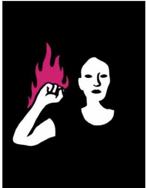
Manifestation 8 March