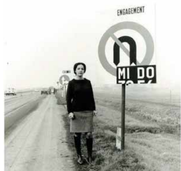
Intellettuali in collegio (1965-1966)