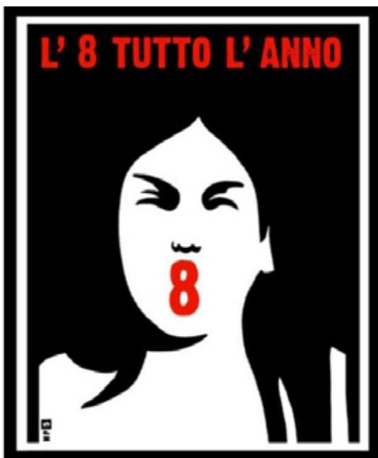
Non Una Di Meno 2018